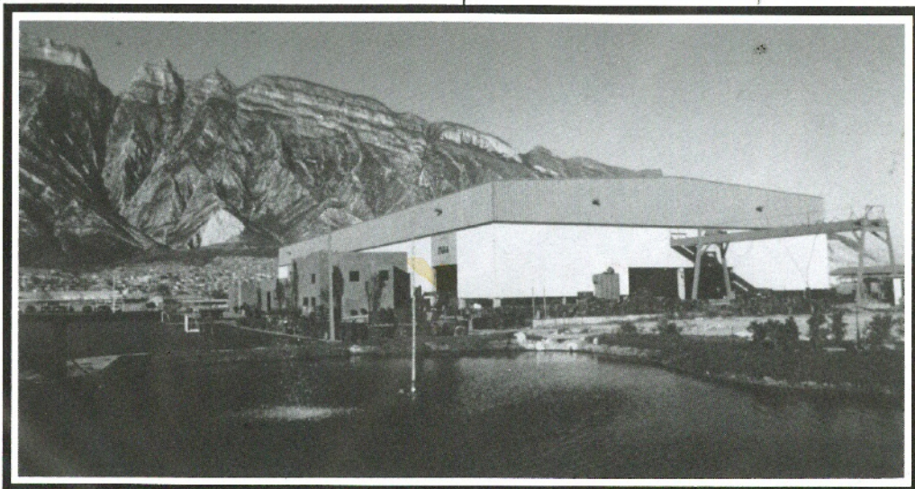
FRISA facility in Mexico